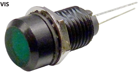
Model 253 NVIS