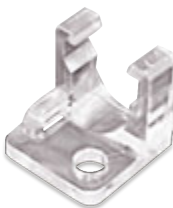
Mounting Clip 701572-25