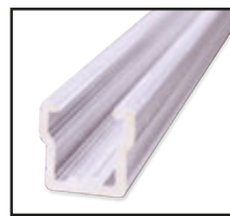
Mounting Track 701456-10