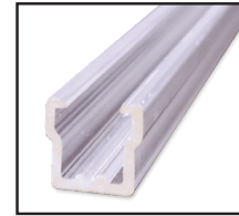
Mounting Track 701456-10