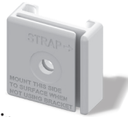
Clip 402106-20 Each carton of SignBOX 3 comes with 40 clips